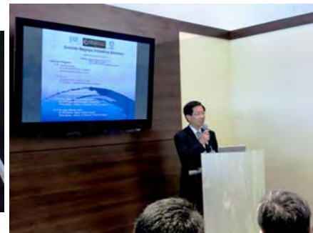
(Farnborough International Airshow)