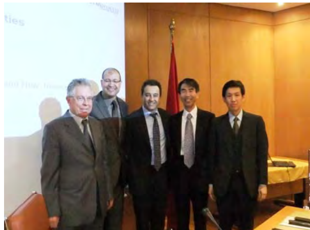
Morocco Minister (centre) SJAC Leader (2 nd from right)