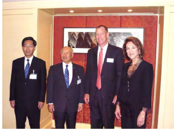
SJAC and AIA Chairman in middle