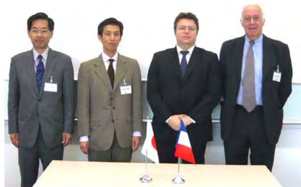
The fifth workshop in Tokyo

Under this framework, both countries' aerospace industries and research institutes conduct cooperative research programs. At the end of the agreement, both GIFAS and SJAC found it beneficial to continue the program and decided to extend it an additional three years, ending in 2011. The fifth workshop meeting was held in Tokyo, Japan, and the status of research programs were reported mutually in such fields as airplane configurations, advanced composite manufacturing and materials, high- temperature composite material, jet noise reduction and acoustic propagation. (November)