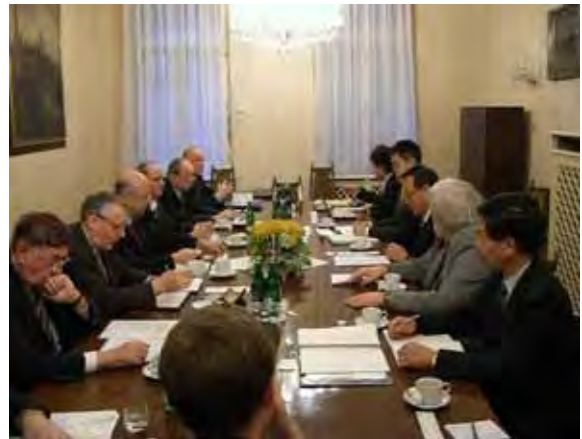
Meeting with Czech Government

The Ministry of Economy, Trade and Industry (METI) organized international aircraft symposiums in Czech and Poland, supported by SJAC and other organizations. Government officials, representatives of organizations, and local companies, presented their industry policies as well as the capabilities of the companies.