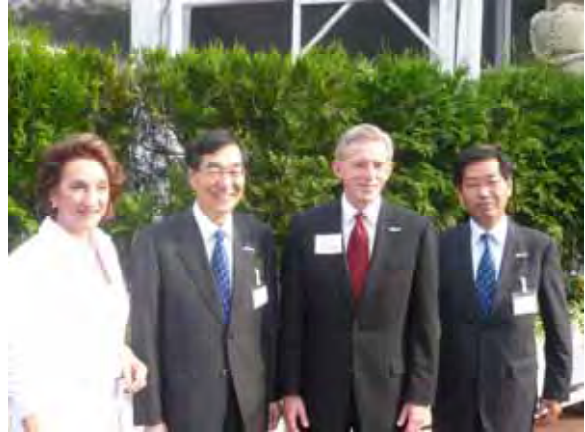
SJAC and AIA Chairman in middle

The joint reception was held with both executives from EU and Japanese aerospace industries and governments at GIFAS Chalet. Attendees were able to network and build close relationships.